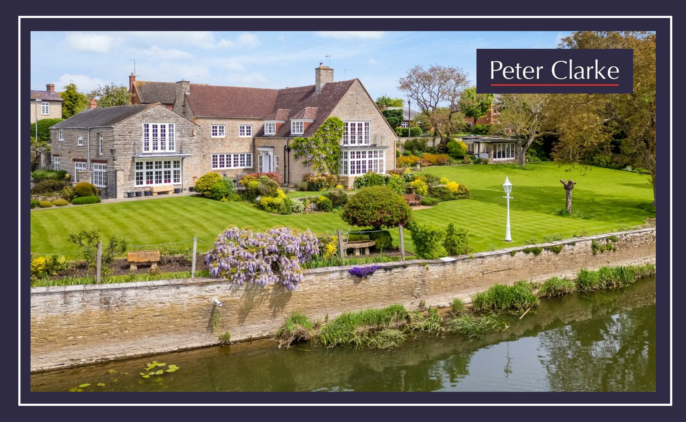
Blythe House Grange Road, Bidford-on-Avon, B50 4BY