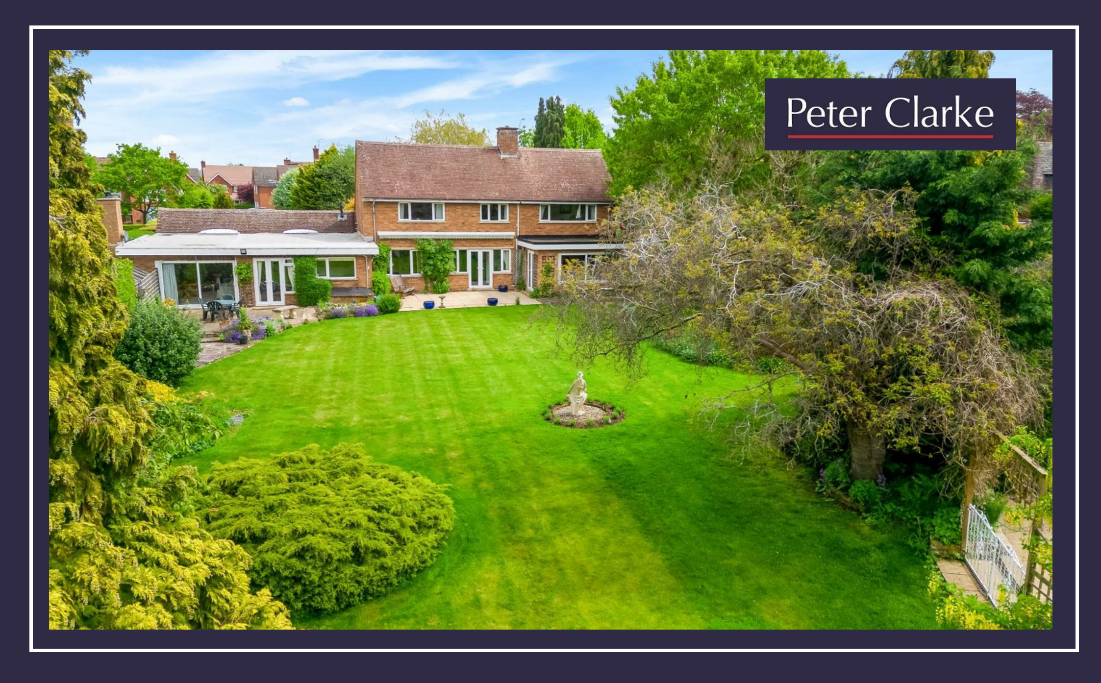
180 Banbury Road, Stratford-upon-Avon, Warwickshire, CV37 7HX