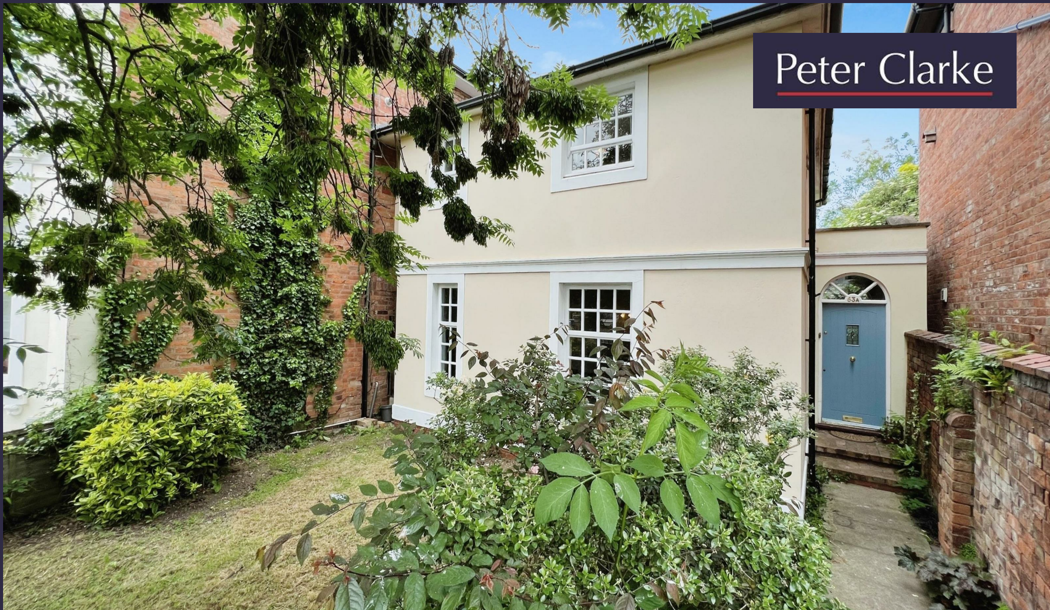
53a Russell Terrace, Leamington Spa, CV31 1HE