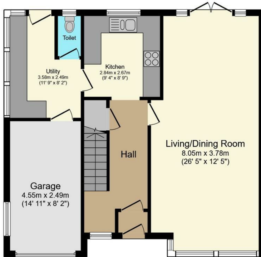
Ground Floor Floor area 69.6 m 2 (749 sq.ft.)