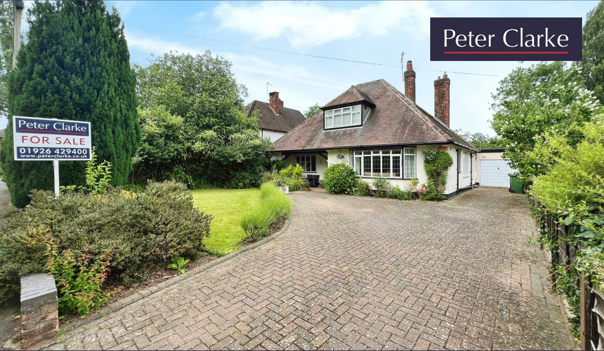
25 Myton Crofts, Leamington Spa, CV31 3NZ

Peter Clarke FOR SALE 01926 429400 www.peterclarke.co.uk