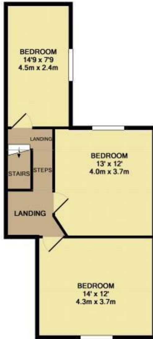
1ST FLOOR APPROX. FLOOR AREA 512 SQ.FT. (47.6 SQ.M.)