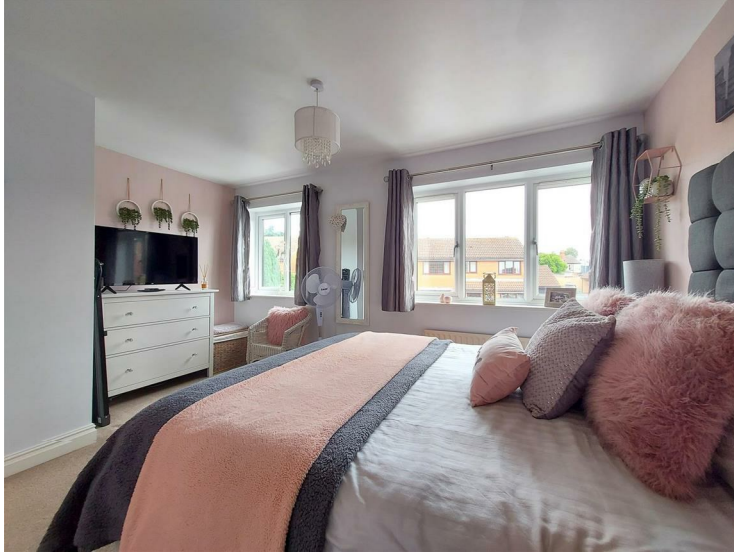
Bedroom Three 11'1" x 7'10" (3.40m x 2.40m)