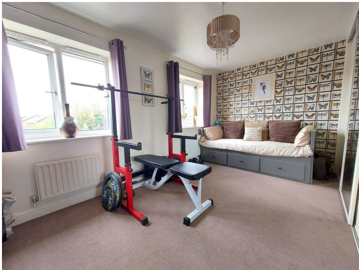
Bedroom Two 14'9" x 7'10" to w/robe (4.50m x 2.40m to w/robe)

Having two double glazed windows to the rear, two radiators and fitted wardrobes.