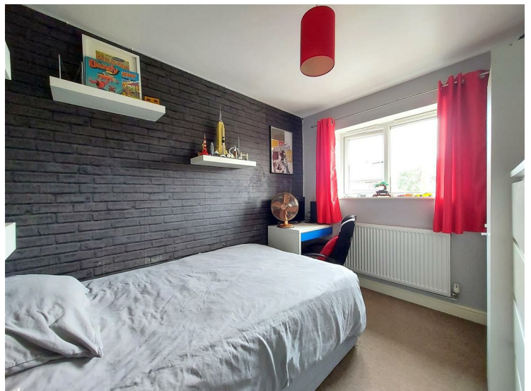
Bedroom Four 9'10" x 8'2" (3.00m x 2.50m)

Having a double glazed window to the front and radiator.