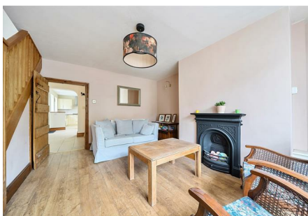
Fig House is located close to the centre of Malpas and offers spacious accommodation. The property is being sold with NO CHAIN and briefly comprises entrance hall, living room, dining room, family room, breakfast kitchen and ground floor shower room. To the first floor is a master bedroom with en-suite shower room, a further bedroom and family bathroom. Outside is a very pleasant courtyard garden. It has double glazing and gas fired heating.