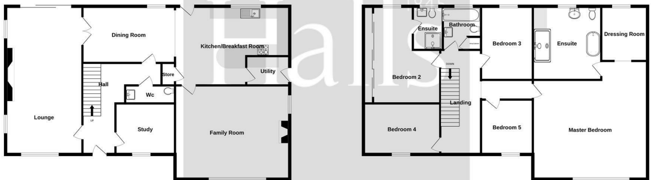
1st Floor 1423 sq.ft. (132.2 sq.m.) approx.

TOTAL FLOOR AREA : 2828 sq.ft. (262.7 sq.m.) approx.