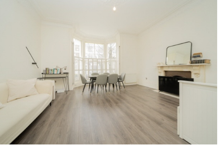
Upper Addison Gardens, W14