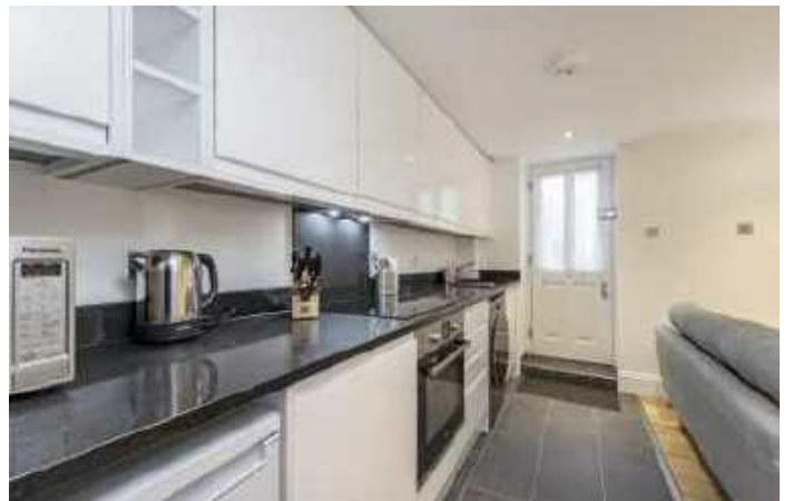
St. James's Gardens, W11