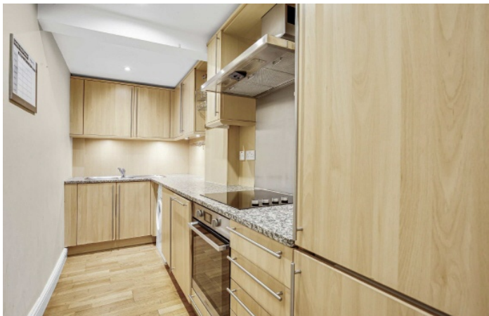
Clanricarde Gardens, W2