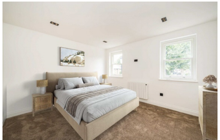
Avondale Park Gardens, W11