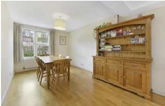
Artesian Road, W2