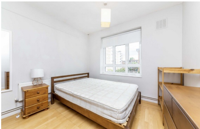
Portobello Court, W11