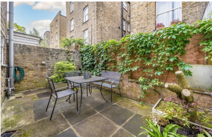
Kelfield Mews, W10