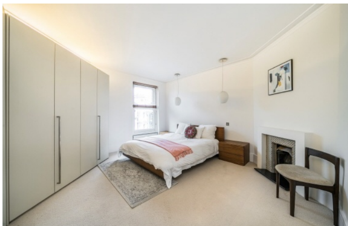
Elgin Crescent, W11