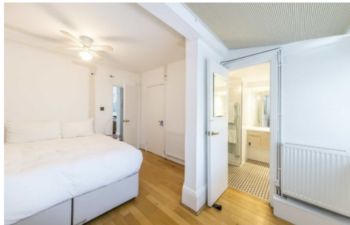
Westbourne Grove, W11