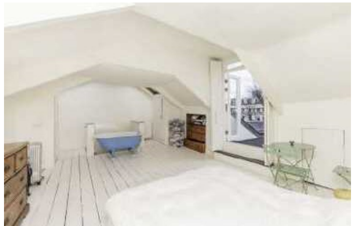
Colville Gardens, W11