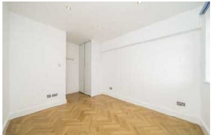
Holland Park Avenue, W11