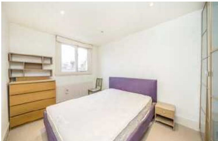
Palace Court, W2