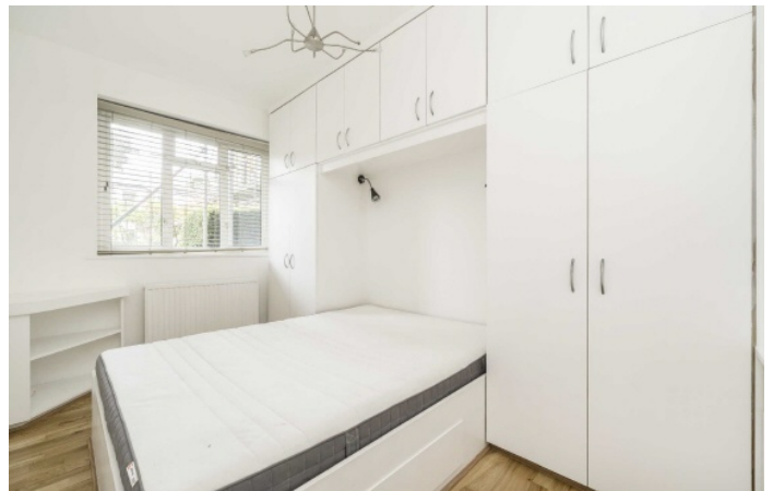
Brewster Gardens, W10