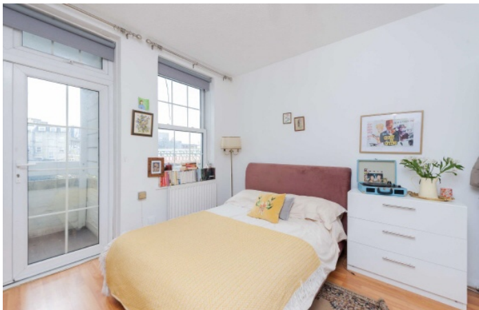
Southern Row, W10