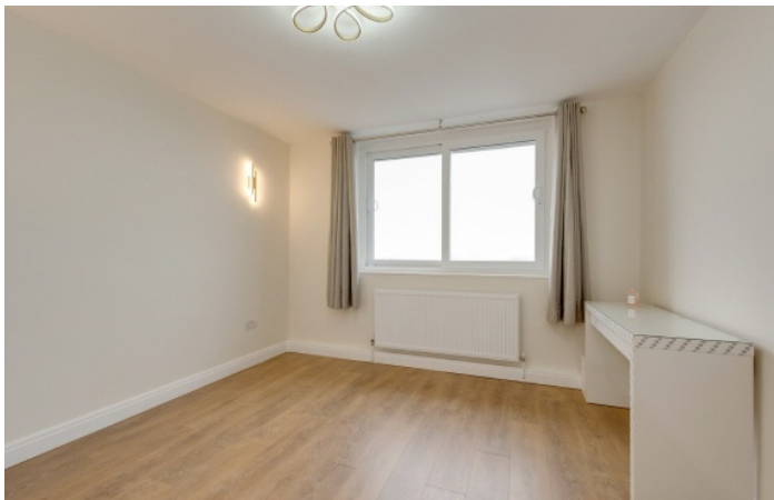
Notting Hill Gate, W11