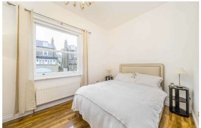
Oxford Gardens, W10