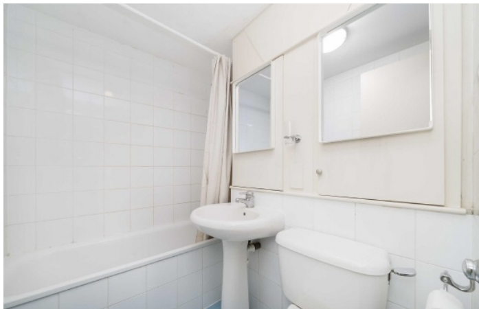
Artesian Road, W2