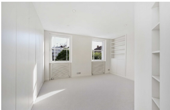
Westbourne Grove, W11