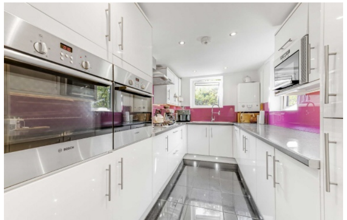
Bramley Road, W10