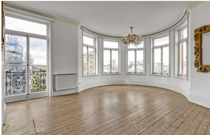
Pembridge Villas, W2