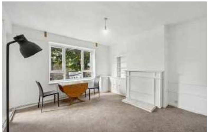
Henry Dickens Court, W11