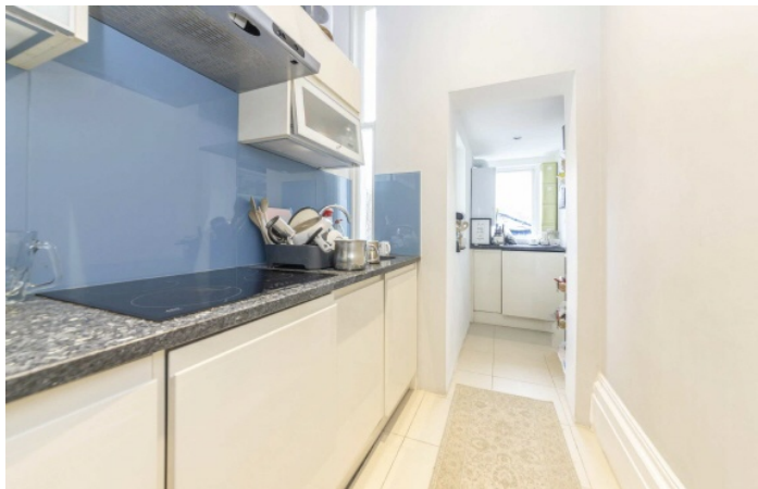
Ladbroke Grove, W11