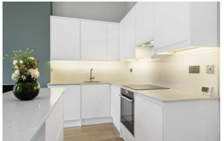
Alexander Street, W2