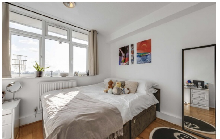
Notting Hill Gate, W11