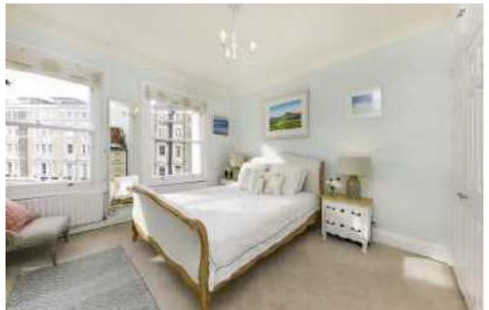
Ladbroke Gardens, W11