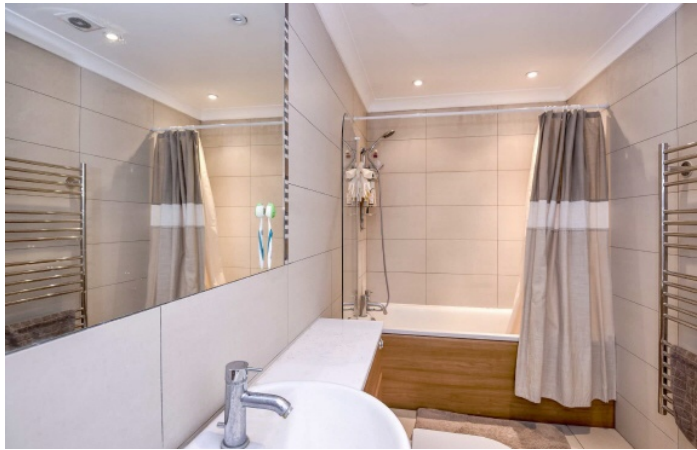
Campden Hill Gardens, W8