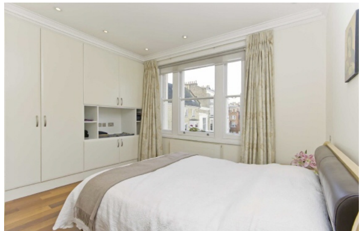
Campden Hill Gardens, W8