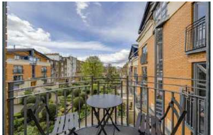
Artesian Road, W2