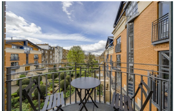
Artesian Road, W2