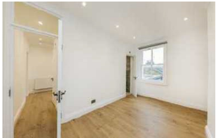
North Pole Road, W10