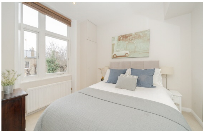
Harcourt Terrace, SW10