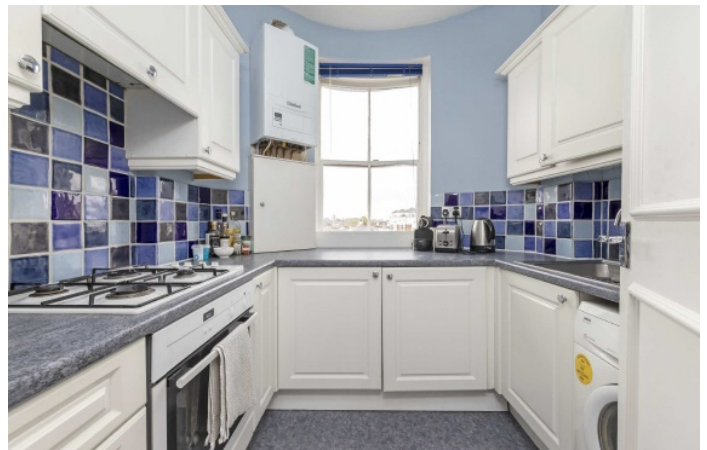
Cornwall Gardens, SW7