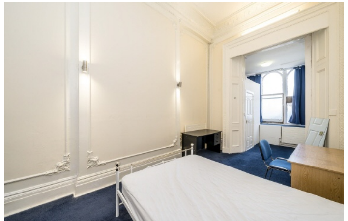
Queen's Gate, SW7