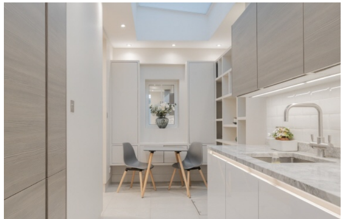
Queen's Gate Mews, SW7