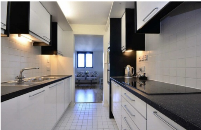
Cromwell Road, SW7