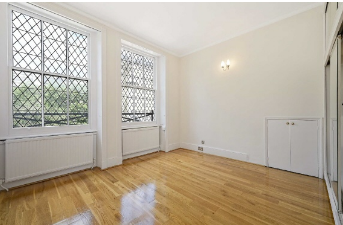
Ennismore Gardens, SW7