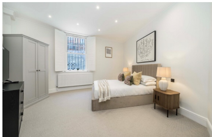
Cresswell Gardens, SW5