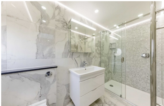
Queen's Gate, SW7