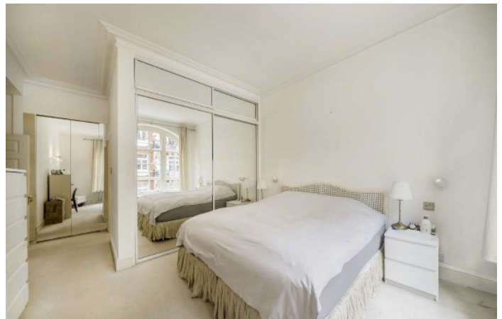
Basil Street, SW3