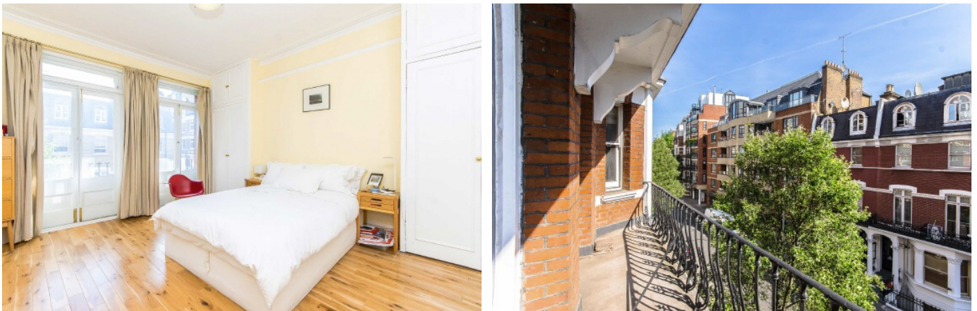
Drayton Gardens, SW10