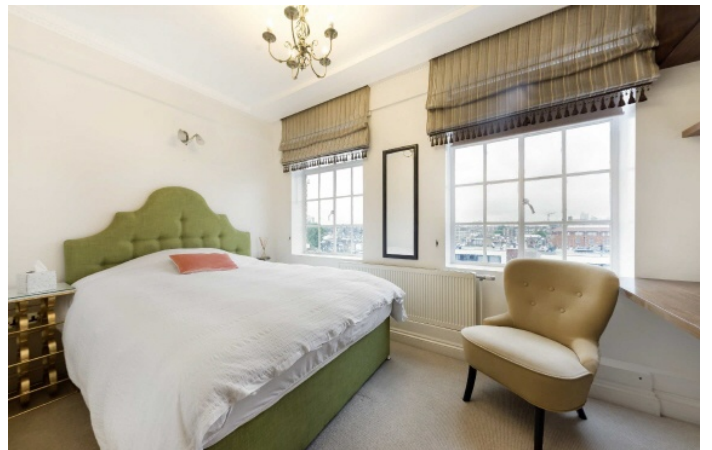
Brompton Road, SW3